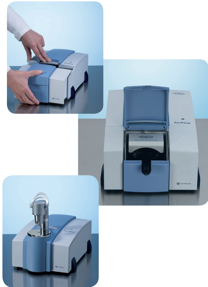
Figure 1: ALPHA FT-IR spectrometer in different configurations: Transmission (upper left), DRIFT (right) and ATR (lower left).